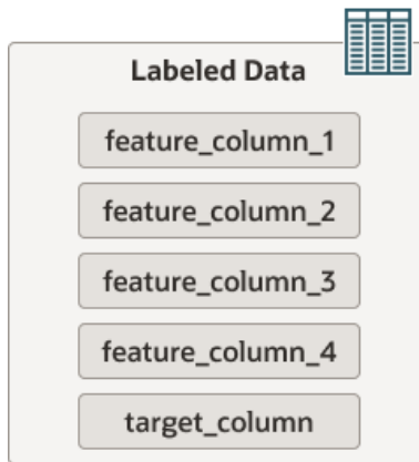
Figure 4.2 Labeled Data

Feature columns contain the input variables used to train the machine learning model. The target column contains ground truth values or, in other words, the correct answers. This dataset can be considered the training dataset .